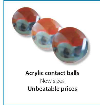
Acrylic contact balls New sizes Unbeatable prices

Visit our stand for great prices and special convention offers