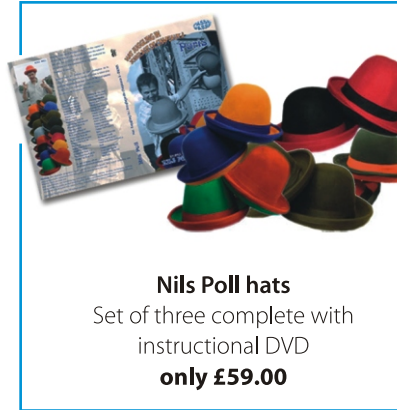
Nils Poll hats Set of three complete with instructional DVD only £59.00

All year round advantages for British clients