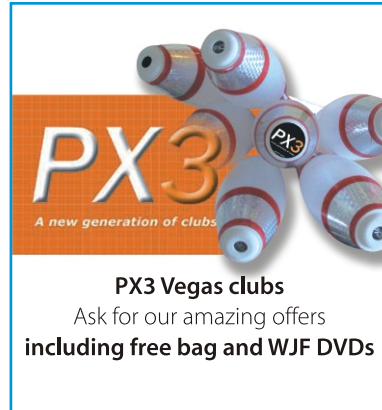
PX3 Vegas clubs Ask for our amazing offers including free bag and WJF DVDs